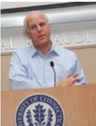
Congressman Christopher Shays, 2008 Conference