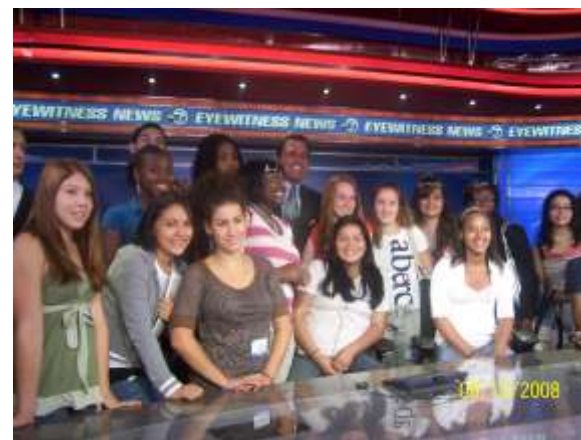
Y.E.S, I Can student's field trip to ABC 7 studio in NYC, August '08