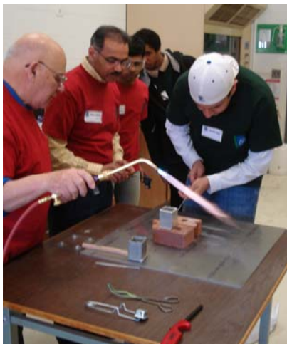
Mini- Material Camp