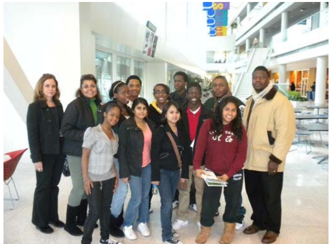
Woodlands High School