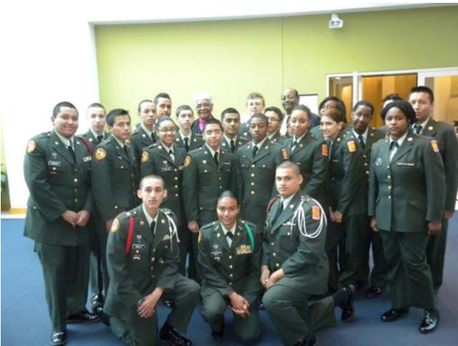
Westhill High School Jr. ROTC

Thank you to all who worked hard to put this great day together and to all our mentors for their continuous support of AMBYESE and education.