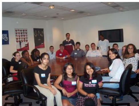
WABC Studios Conference Room.